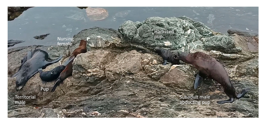
FIGURE 2 A subadult male Guadalupe fur seal entering the periphery of the territory of a sleeping adult male at site A during the reproductive season in the San Benito Archipelago to harass and abduct a pup.

Once the perpetrator seemed to successfully lure a pup closer, he would rush forward and attempt to grab the fleeing pup by the back of the neck or body. Once caught, the pup would be carried or dragged out of the reproductive territory and kept for 10–30 min, with the longest abduction lasting >12 hr. When their abduction attempts failed, the mostly juvenile perpetrators would linger in the territory for hours, resting and mimicking female-like behaviors such as open-mouth sniffing. Eventually, another opportunity to harass or abduct a pup would arise.